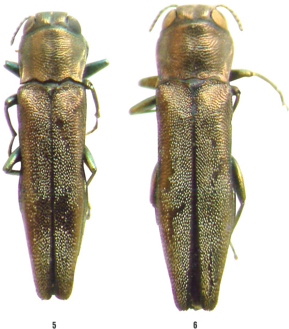
Figs 5-6. Agrilus (Agrilus) funebris vanikorensis subsp. nov. 5 – male, holotype, 4.0 mm; 6 – female, paratype, 4.4 mm.

Distribution. Accordingly to the recent revision of the genus (Lander, 2003), this subspecies is widely distributed across all Indonesian Islands reaching eastern Papua New Guinea, Solomon Islands and Northern Queensland (Cape York). All specimens collected belong to the form which was described as a separate species C. aurofoveata (Guérin-Méneville, 1830) and which was synonymised with C. radians radians by Lander (2003) as a variety aurofoveata .