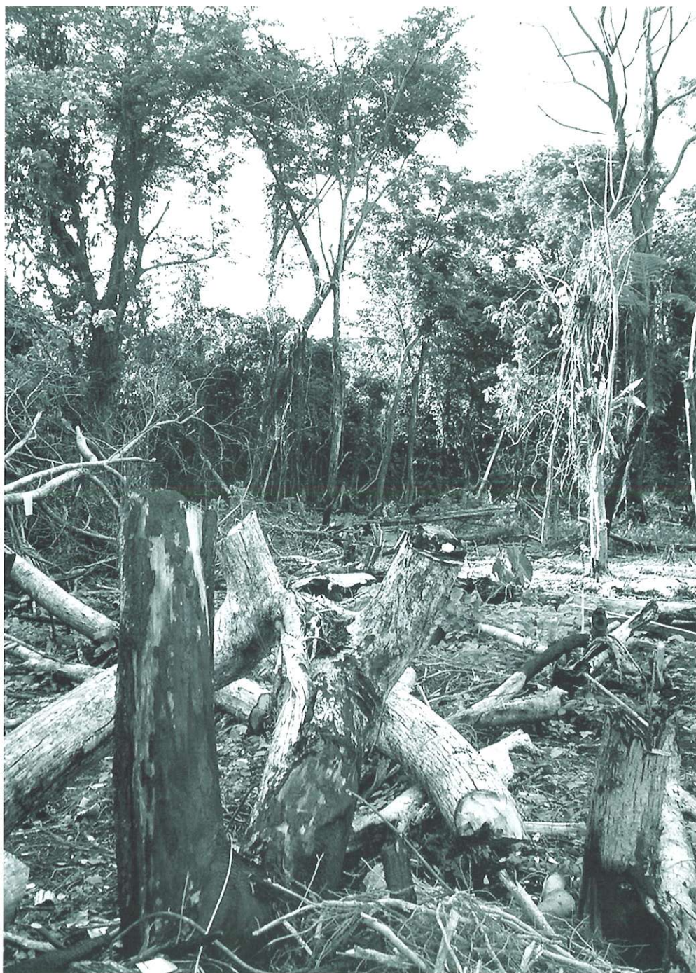
Fig. 7. A biotope of Agrilus funebris vanikorensis subsp. nov. near Payou.